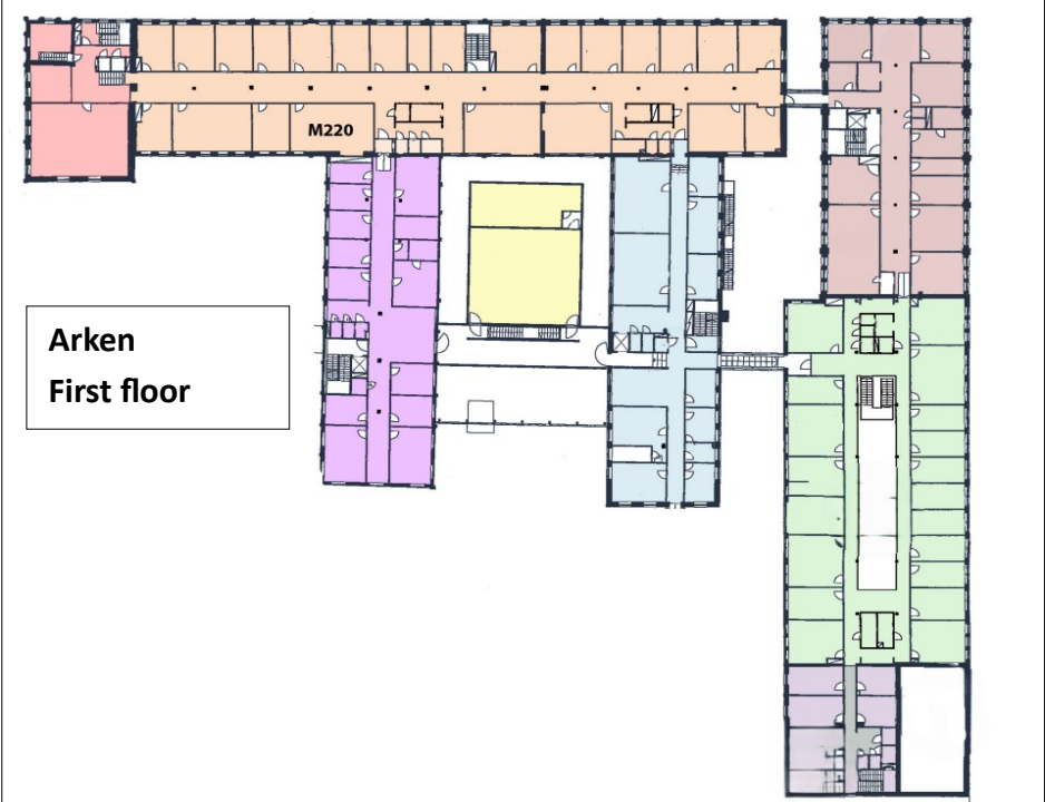
Arken First floor