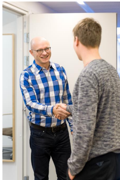
MENTAL HEALTH CARE