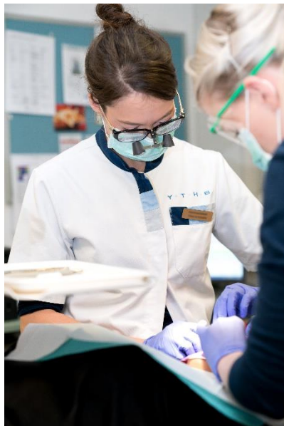
ORAL HEALTH CARE