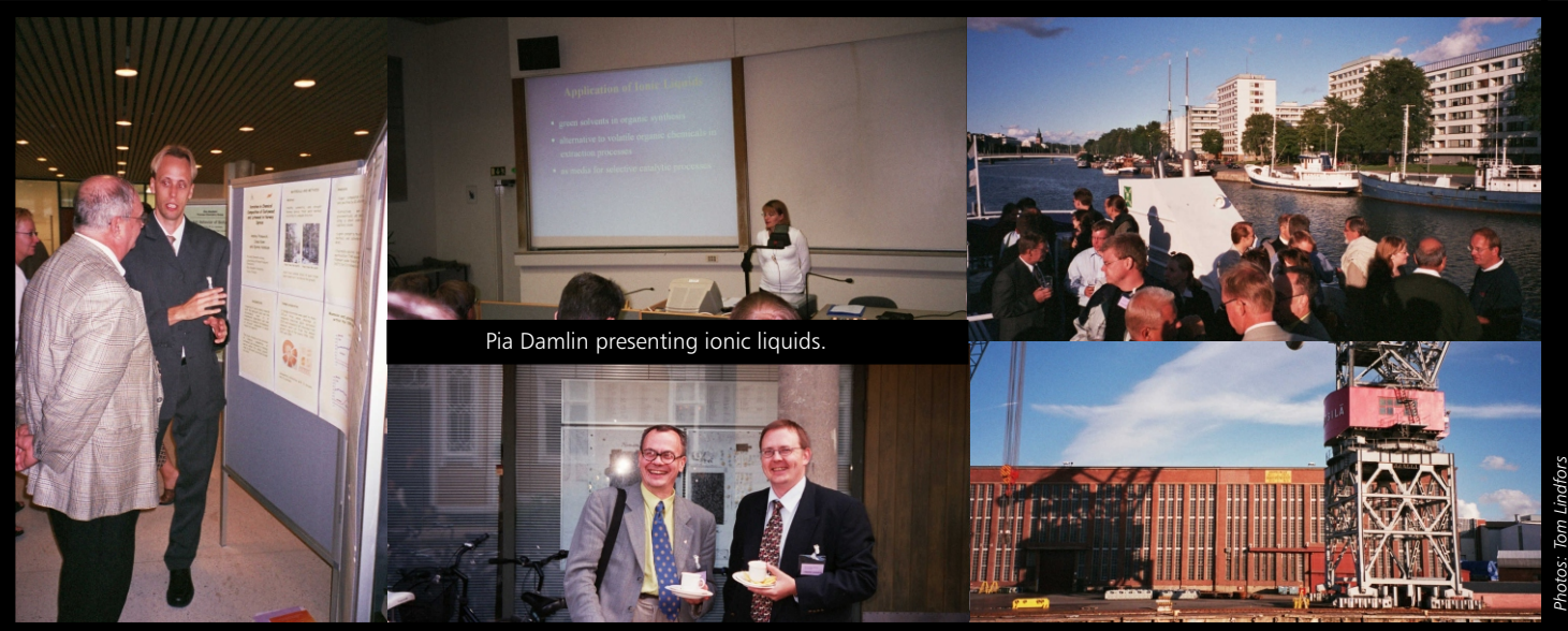
Pleased coffee drinkers.